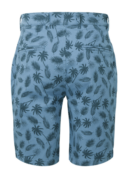
Blue Palm Print