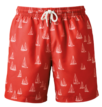
Washed Coral Nautical

100% Polyester microfibre, 115gsm S - 2XL