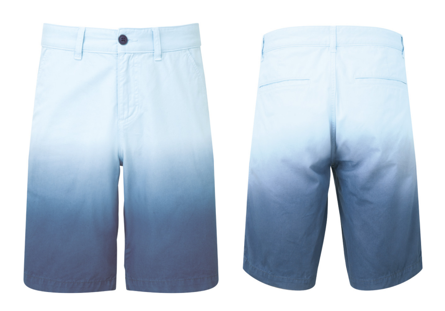
Blue Dip Dye