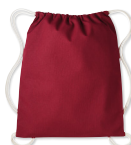
PAN 195C BURGUNDY/NATURAL