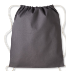
PAN 424C SLATE LIGHT GREY/ NATURAL