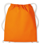
PAN 165C ORANGE/NATURAL