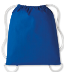
PAN 7687C ROYAL/NATURAL