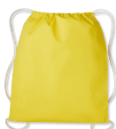
PAN 108C SUNFLOWER/ NATURAL