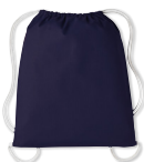
PAN 532C FRENCH NAVY/ NATURAL