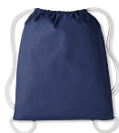
PAN 533C OXFORD NAVY/ NATURAL