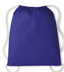
PAN 7664C PURPLE/NATURAL