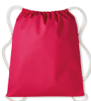
PAN 214C HOT PINK/NATURAL