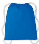
PAN 300C SAPPHIRE/NATURAL