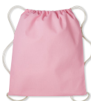
PAN 2043C LIGHT PINK/NATURAL