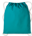
PAN 328C JADE/NATURAL