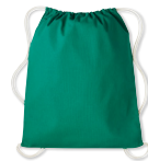
PAN 343C BOTTLE GREEN/ NATURAL