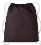
PAN BLACK 7C STORM DARK GREY/ NATURAL