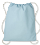
PAN 5455C PASTEL BLUE/ NATURAL