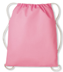
PAN 670C PASTEL PINK/ NATURAL