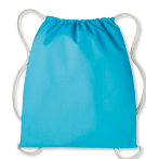
PAN 311C TURQUOISE/NATURAL