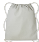
PAN 421C PASTEL GREY/ NATURAL