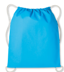
PAN 7703C HAWAIIAN BLUE/ NATURAL