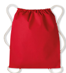
PAN 7420C HOT RED/NATURAL

Fabric 100% Cotton Weight 150gsm Size Dimensions 37 x 46cm